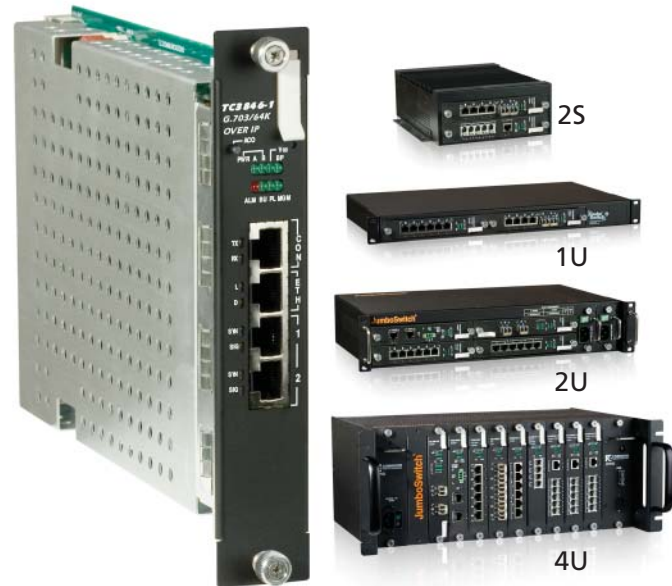
TC3846-1 with Various JumboSwitch Cages and Chassis

Featuring extremely low latency of less than 5 msec., one way, the TC3846-1 G.703/64k-over-IP Gateway extends 64kbps G.703 co-directional circuits over Ethernet/IP networks. It is simple to configure and supports both point-to-point and point-to-multi point topologies.