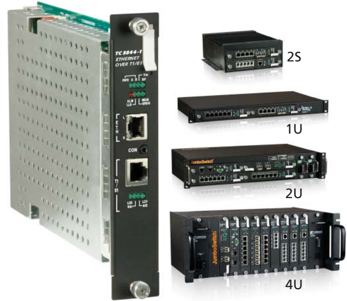
TC3844-1 - IP-over-T1/E1 Gateway

The TC3844-1 Ethernet-over-T1/E1 Gateway allows the user to extend Ethernet backhaul applications to remote locations over existing TDM Telecom infrastructure. It converts the Ethernet data into framed or unframed T1/E1 format for transmission over T1/E1 links, and the modules are used in pairs.