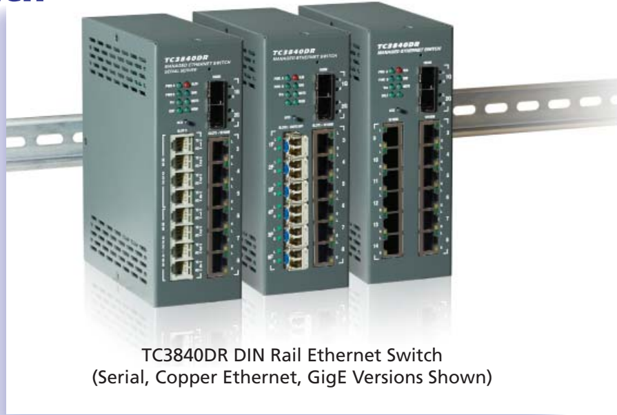
TC3840DR DIN Rail Ethernet Switch (Serial, Copper Ethernet, GigE Versions Shown)

T he JumboSwitch-DR DIN Rail Ethernet Switch is a compact, efficient Industrial Ethernet switch solution with full JumboSwitch network compatibility and integrated Serial Server or Ethernet card expandability. It is compatible with all JumboSwitch product family chassis, management software, features and options, and guarantees maximum reliability and performance for industrial automation and mission critical redundant ring network applications.