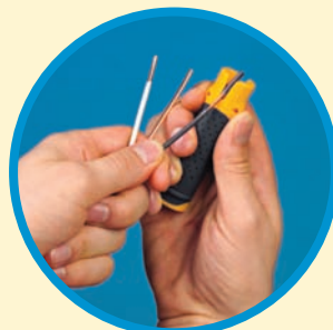
Strips wire carriers.