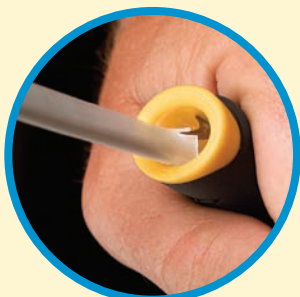
Insert Romex® into specially designed blade.