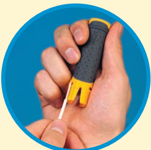
Strip length gauge guide.