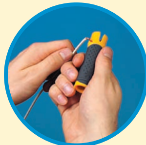
Loops wires for screw connections.