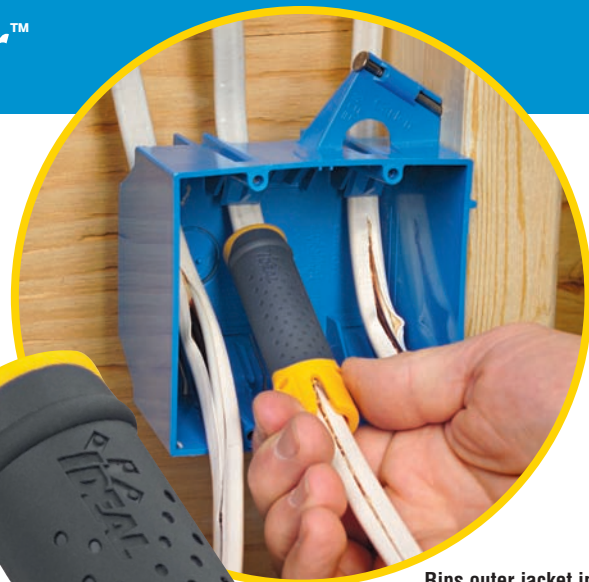
Rips outer jacket in hard to reach areas