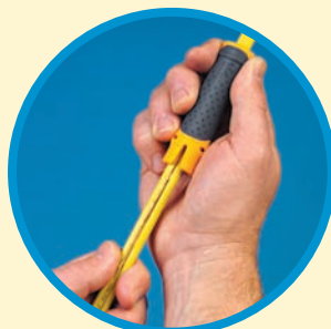
Rapidly rips Romex® Sheathing.