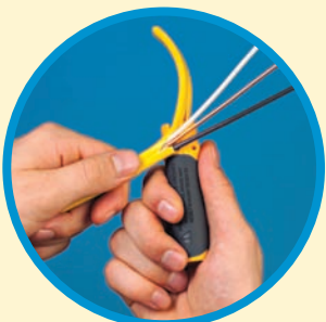
Clips sheathing clean.