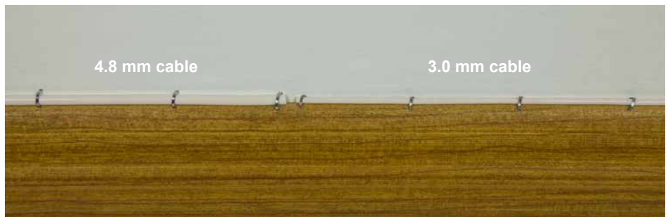
4.8 vs. 3.0 mm Cable Comparison (stapled to baseboard)

For additional information please contact your sales representative. You can also visit our website at www.ofsoptics.com or call 1-888-fiberhelp (1-888-342-3743) USA or 1-770-798-5555 outside the USA.