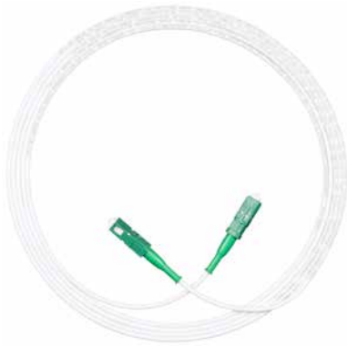
EZ-Bend 3.0 Ruggedized Assembly