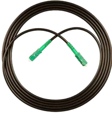
EZ-Bend 3.0 Ruggedized Assembly