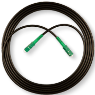
EZ-Bend 4.8 Indoor/Outdoor Ruggedized Assembly