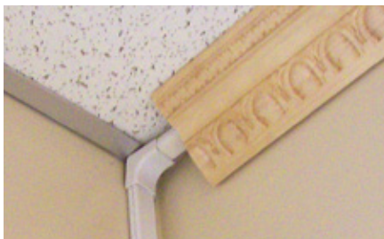
MDU and in-home solution