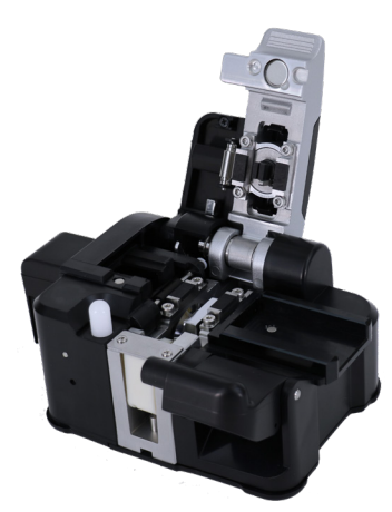
Wide Lid Angle for Easy Opening