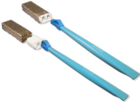
LC SFP Parking Cap With Extraction Tool SFP Cages Not For Sale