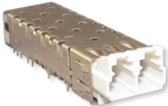
Can and Cap (in)