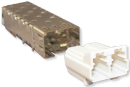
Can and Cap (out)