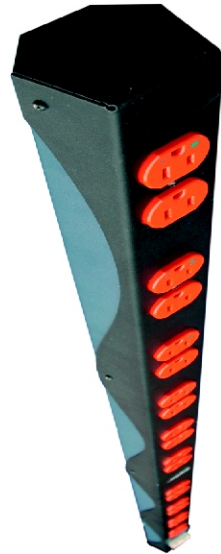
Vertical Power Strip