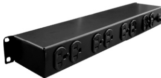
Horizontal Power Strip