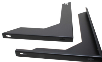
Mounting bracket set Stock No. WB-SE-02