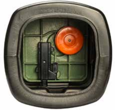
Shown with Optional Marker Locate Device