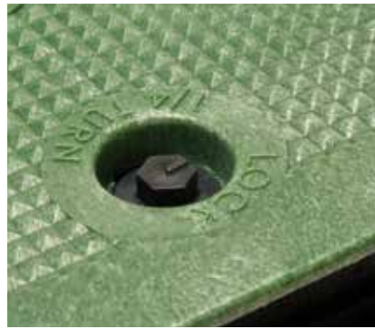
Captive bolt device opens with only 1/4 turn