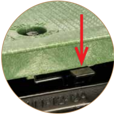
SELFLOCK closes and seals with audible "Click"