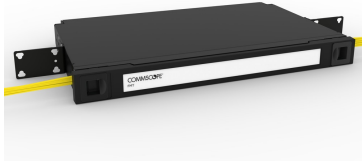
FMT Fiber Splice Panel, with sliding tray, unloaded, 1RU, 19 in, black